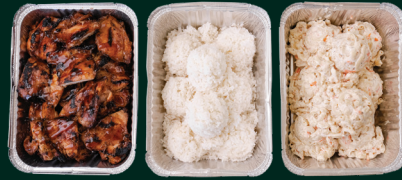
Feeds 6 $71.99

A complete meal for a family or group of 4 or 6. Includes your choice of 1 meat, white rice, and macaroni salad. Substitute with brown rice, mixed veggies, or tossed salad on request. Comes with sauce cups. Price varies on protein choice.