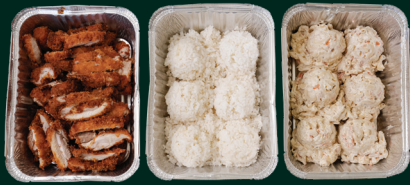
Feeds 4 $47.99